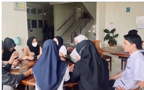
Figure 3. Discussion of Work Program

Based on discussions with community leaders in Watugajah VI, the majority of the population are farmers and most of them are elderly. The main problems encountered in this hamlet are related to health, especially hypertension, and the lack of health education. In addition, in this hamlet, there is a routine activity that is held every 16th, namely Posyandu Lansia. Therefore, after discussing with the field supervisor about the work program, the plan is to conduct counseling on hypertension and blood pressure screening. The target of this activity is the elderly in Watugajah VI hamlet, and the counseling will be held during the implementation of Posyandu Lansia activities.