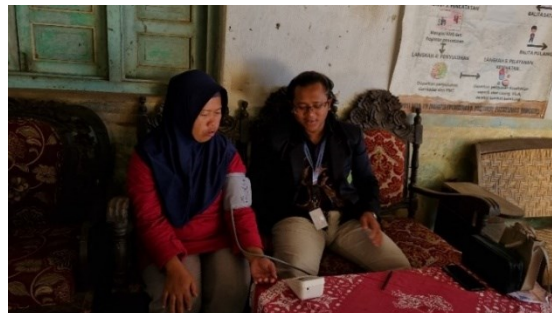
Figure 7. Blood Pressure Screening