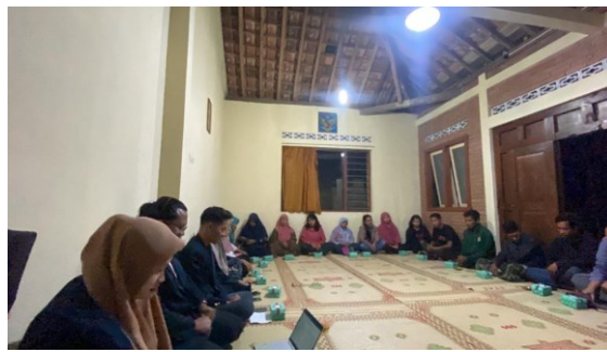
Figure 2. Discussion With Community Leaders