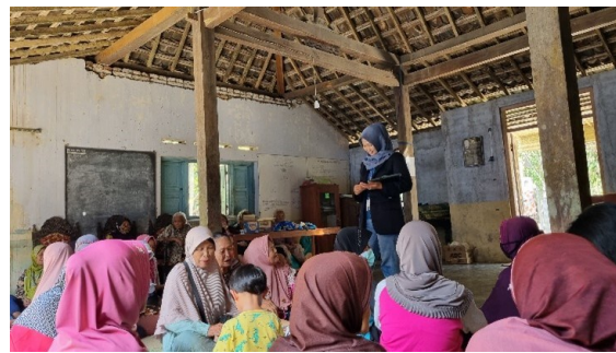
Figure 6. Discussions and Q&A