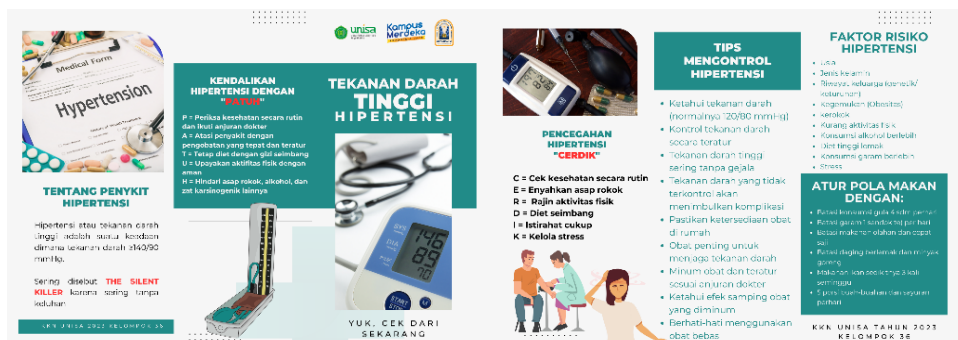
Figure 4. Hypertension Leaflets

Counseling activities regarding hypertension will be carried out at the Elderly Posyandu of Watugajah VI. For this counseling, a presentation aid using power point and leaflets containing a brief and easy-to-understand explanation of hypertension will be used. The method that will be applied is through lectures, and there will be discussion and question and answer sessions as part of the counseling activities.