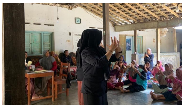
Figure 9. Brain Exercise With The Elderly