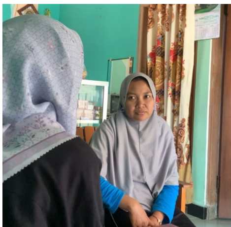
Figure 10. Evaluation by Posyandu Cadre

The evaluation given by one of the cadres who accompanied during the delivery of the material was that the material was very good and easy to understand, the participants were very enthusiastic, but the language used in the leaflet was still difficult to understand by some residents, especially the elderly. Overall, the counseling was considered to have run well and effectively, with hopes for further improvement in the future.