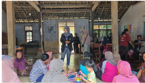
Figure 5. Delivery Of Material

Then, at the beginning of the counseling, the service team distributed leaflets to the elderly participants and started the counseling session. After the presentation of the material, discussion and question and answer sessions were held with the participants with the hope that the elderly could increase their knowledge about hypertension. This counseling activity lasted for 45 minutes. After finishing the Posyandu event, students also involved the elderly who attended in a joint practice, namely doing brain exercises.