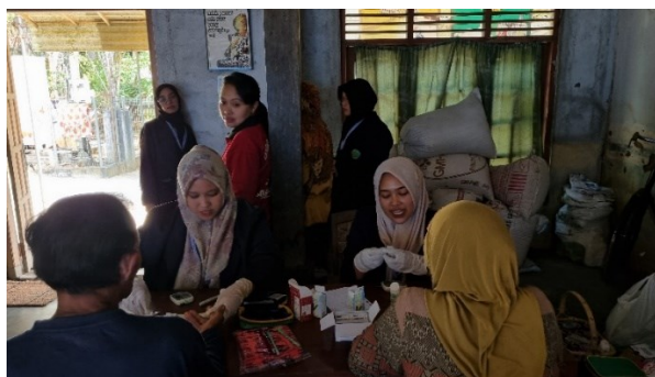
Figure 8. Real-time Blood Sugar Check